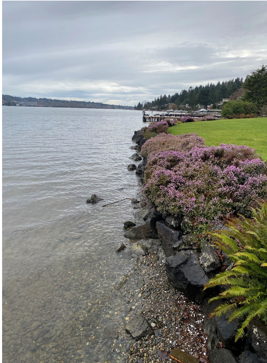
View of lawn and ornamental groundcover extending to edge of shoreline.