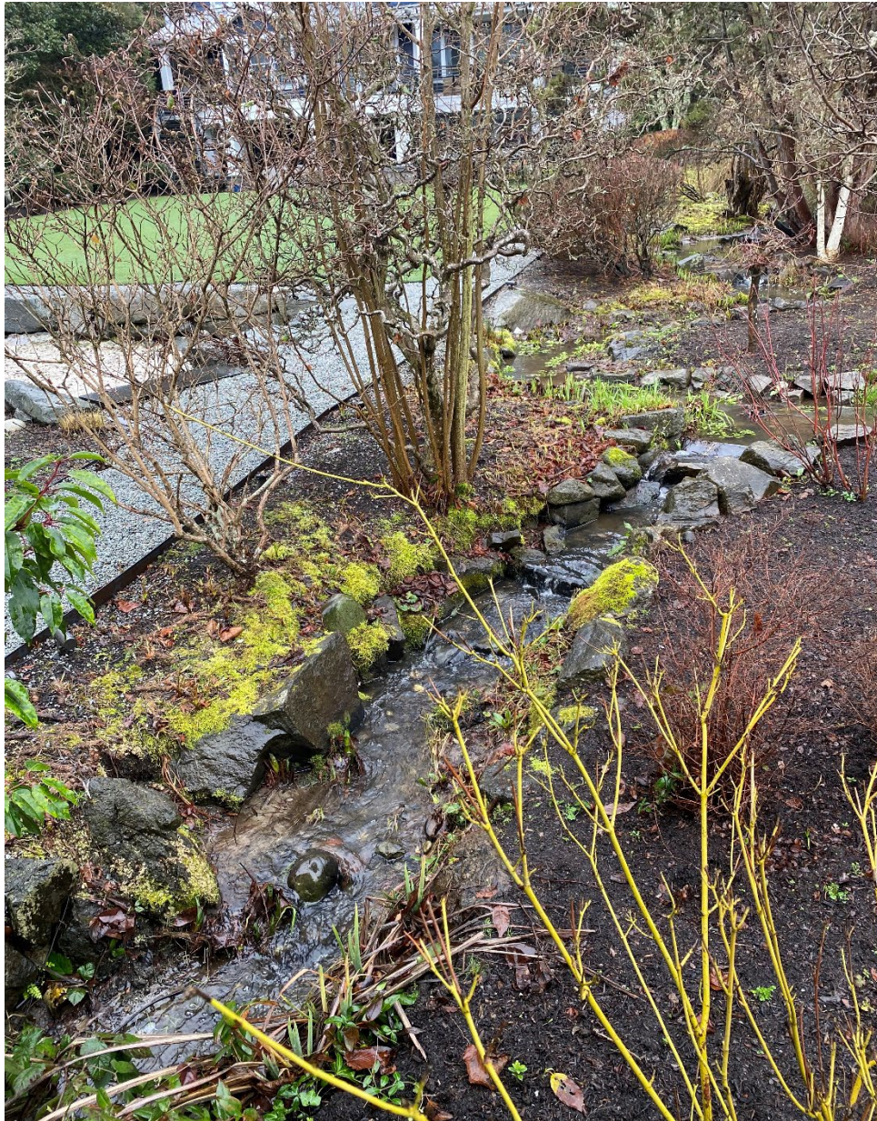
Typical view of rocked stream channel with plantings.

The lower portion of Stream 1 is considered a Type F stream by the City that requires a 120-foot buffer and 10-foot structure setback. The upper off-site portion of the stream is considered a Type Np stream that requires a 60-foot buffer and 10-foot structure setback. The small piped portion of the channel requires a 45-foot structure setback that is located entirely within the two stream buffers.